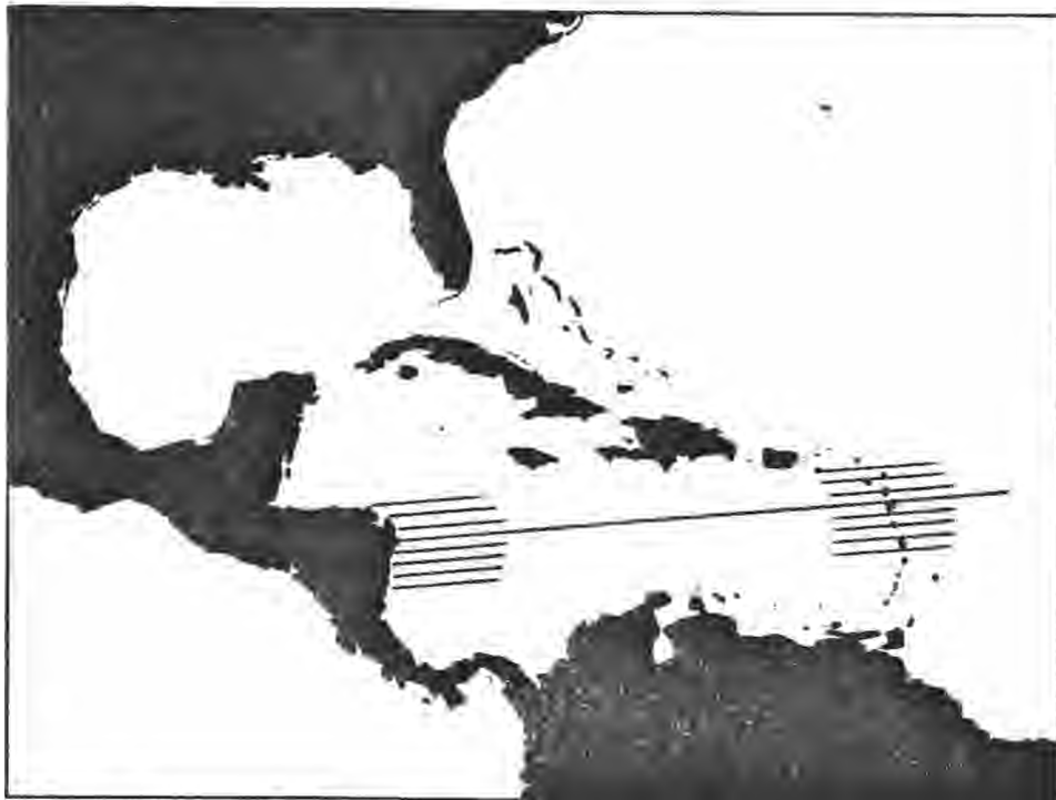
Fig. 1. Map of the Recent Caribbean Sea showing the approximate position of the line of abrupt faunal shift that separates the Caribbean Province into northern and southern components.

common ancestor. Furthermore, many of these separate ancestral forms appear to have been members of their own species pairs in the Pliocene, indicating that the common ancestor for all must date from an earlier time. I will here refer to these ancestral interprovincial sibling species pairs, which were also mutually exclusive in their ranges, as "ancestromas." Some of the Caribbean ancestromas and their living descendant pairs are listed in Table 2. The key to interpreting paraprovincialism, therefore, lies in detecting ancestromas in the fossil record.