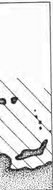
ms of the Gatunian e lines rising to the

e and are useful e is sharply de tolls to east of on, wide-ranging ta. To the west and C. annulus . een found to be