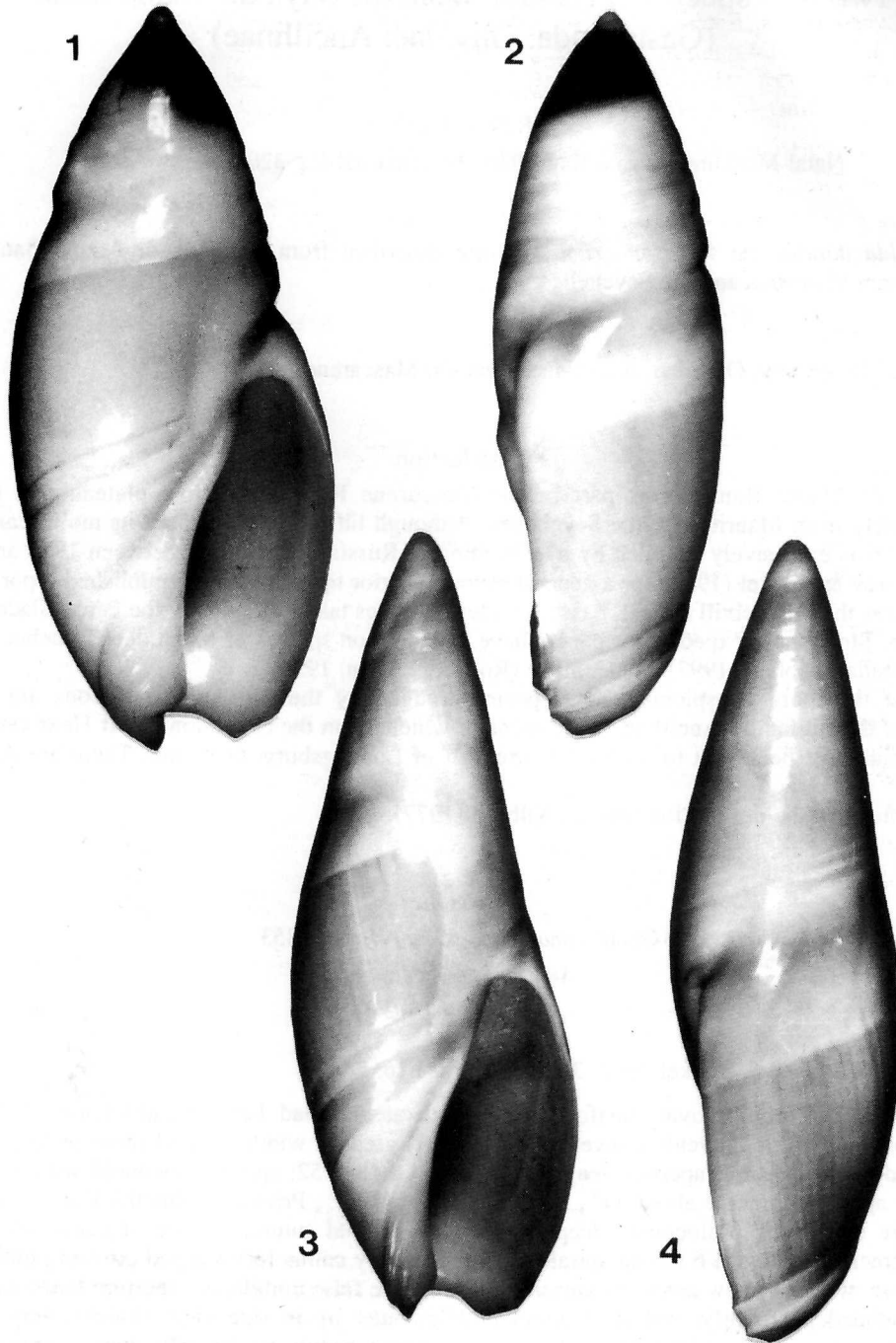
Plate 1. Amalda danilae and Amalda trippneri n. spp. 1-2, holotype of A. danilae , Natal Museum L1606/T979, dimensions 34.4 x 15.1 mm. 3-4, holotype of A. trippneri , Natal Museum L1607/T980, dimensions 53.8 x 19.6 mm.